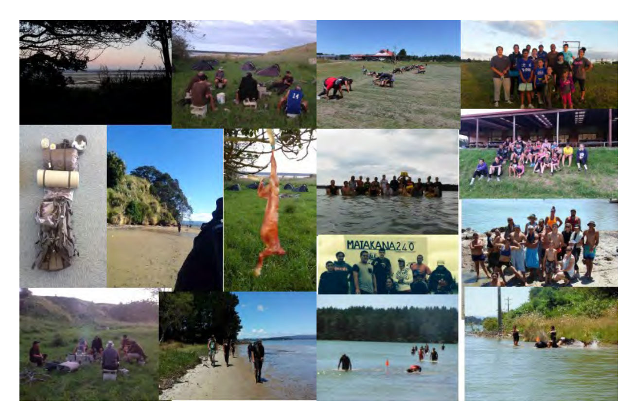
Figure 5: Collage of activities from the programme

The main phase of the programme commenced at the beginning of December 2014 and has since then held six rangatahi camps, movie nights and facilitated a two-day Rangatahi Leadership programme 'Te Amorangi', during the school holidays. Island Style Crossfit continued during this time, with three sessions being held almost every week and close to 400 attendees participating overall.